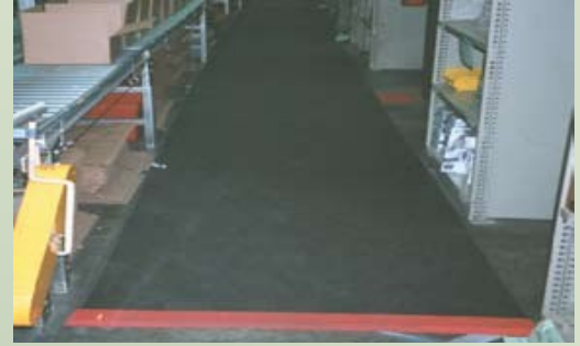
Ortho 1 Molded Material with Antimicrobial